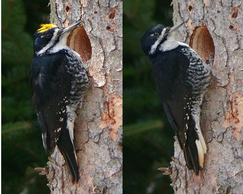
Figure 1: Adult male (left) and female (right) Black-backed Woodpeckers in New Hampshire.