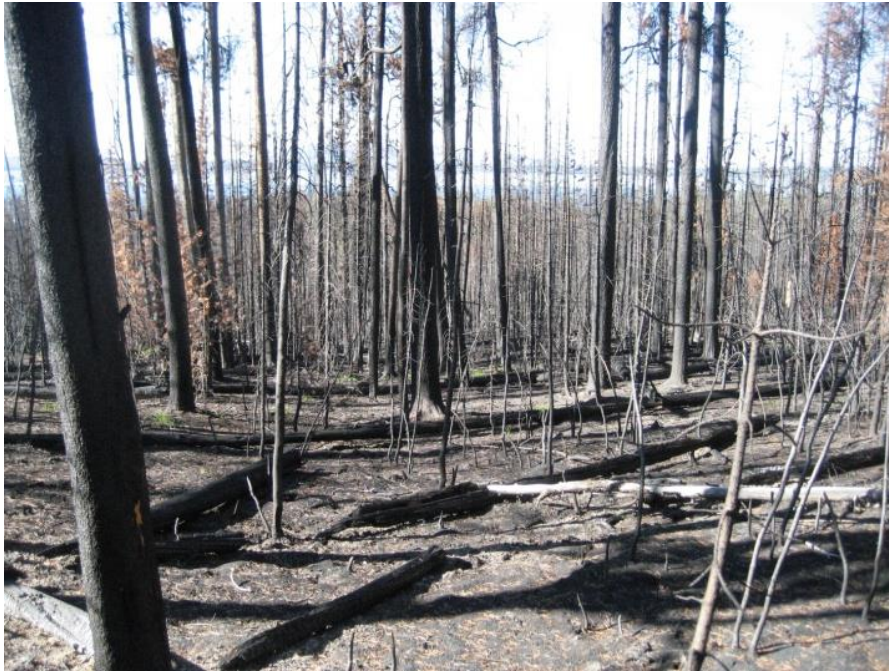
Figure 3: Ideal Black-backed Woodpecker habitat. Burned forest from the 2009 Arnica Fire, in Yellowstone National Park, 1 year post-burn.