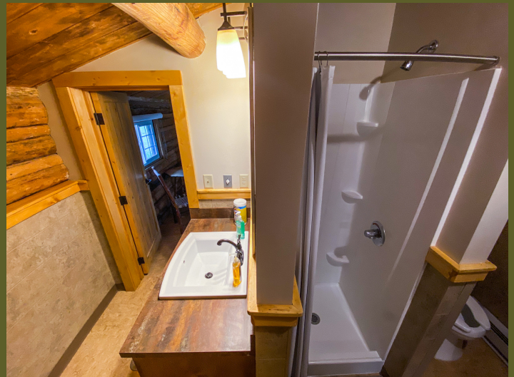
Photos of inside cabins.