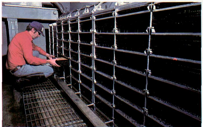
One of the most important parts of hatchery management is control of disease. State hatchery stock is regularly tested for diseases that might threaten fisheries. Permits for sale and transport of fish are also intended to protect Wyoming from fish diseases and unwanted species. Walleye (previous page) and rainbow trout (above) are routinely raised and stocked in Wyoming.