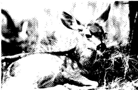
Most mortality in ungulate populations occurs among the youngest age classes.

subsequently was not studied. We did not review these studies. No studies have implicated predation by mountain lions as a major mortality factor of neonatal fawns, but this may be because this aspect has not been studied with radiotelemetry. However, mountain lions have been implicated as major predators of adult deer.