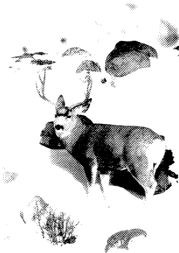
State agencies have expressed concerns about apparent declines in mule deer populations across the western United States.

Bartmann et al. (1992) defined compensatory and additive mortality by explaining that an increase in