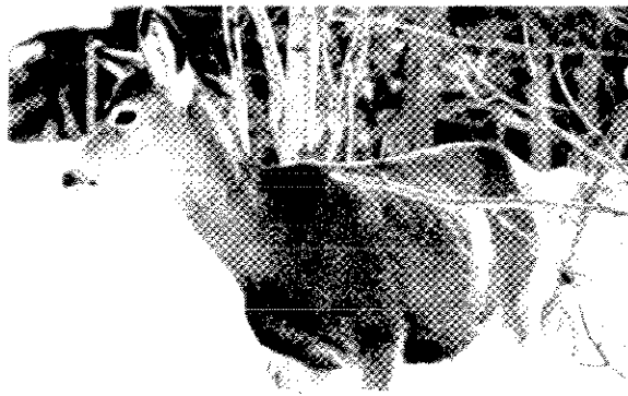
Deep snow makes deer more vulnerable to predation.

The Western States and Provinces Deer and Elk Workshop (R. M. Lee, Arizona Game and Fish Department, unpublished data) surveyed western states and provinces to determine whether they practiced predator reduction to increase wild ungulate populations and determine annual expenditures. At the time of the survey, only British Columbia indicated wolves, mountain lions, and bears were important predators of mule deer and that they intended to provide more liberal predator hunting and trapping seasons in areas where predation was suppressing deer populations. They also indicated that wolf reduction may be essential to maintain ungulate populations at prescribed levels in some areas. Alaska, California, Colorado, Idaho, Montana, Nevada, New Mexico, Oregon, Texas, and Washington reported they did not have predator reduction programs to benefit big-game species, but they did have programs for problem wildlife or depredation reduction for livestock or other agriculture programs. Arizona was one of the few states that had an active predator reduction program to reduce coyote populations to improve pronghorn ( Antilocapra americana ) fawn survival