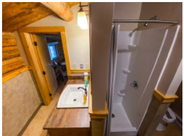
Photos inside of cabins.