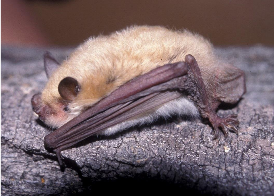
Figure 1: A Yuma Myotis in Wyoming.