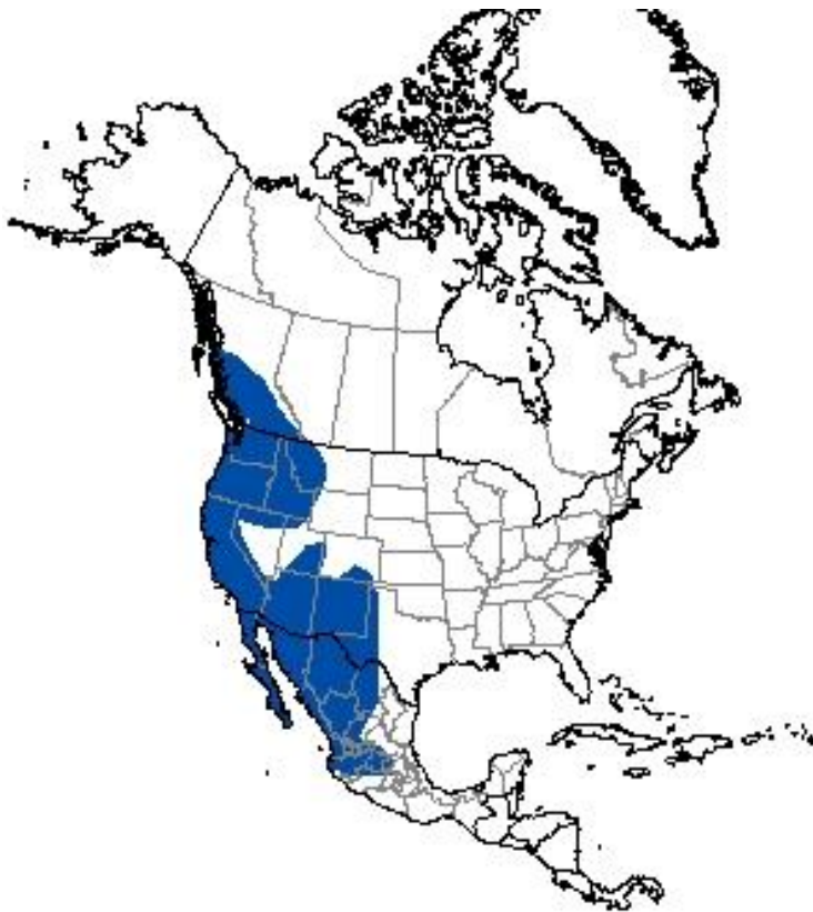
Figure 2: North American range of Myotis yumanensis . (Map from: Patterson, B. D., et al. (2007) Digital Distribution Maps of the Mammals of the Western Hemisphere, version 3.0, NatureServe, Arlington, Virginia.)