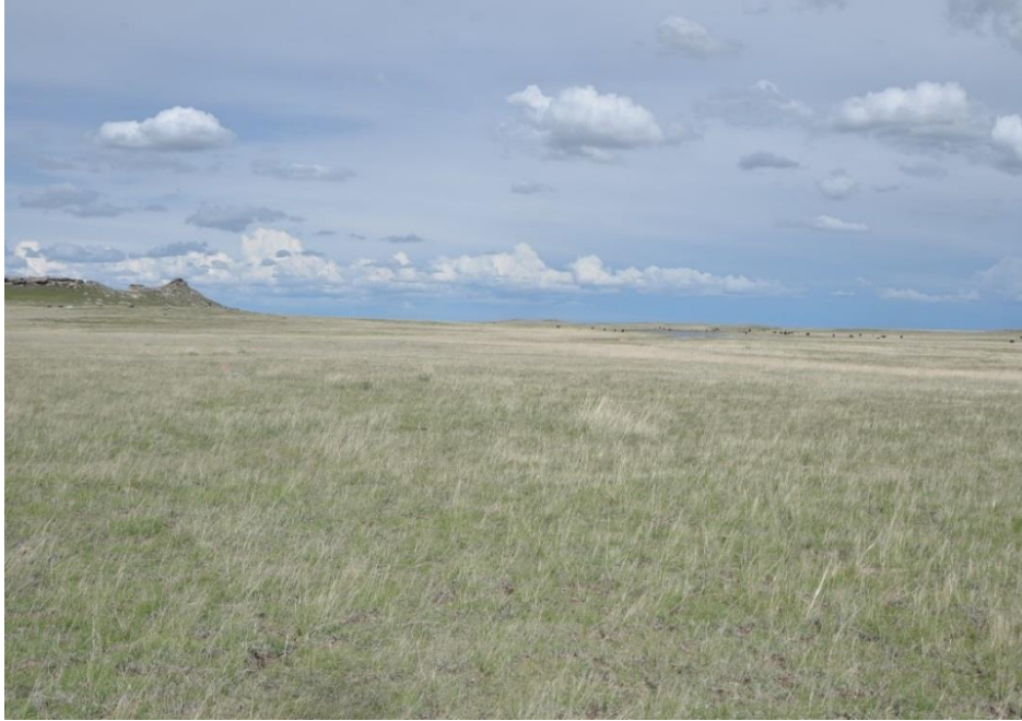
Figure 3: Grassland habitat where Hispid Pocket Mouse has been captured in Goshen County, Wyoming.