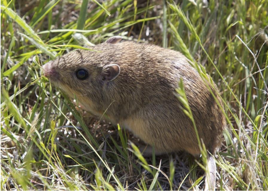
Figure 1: Hispid Pocket Mouse captured in Goshen County, Wyoming.