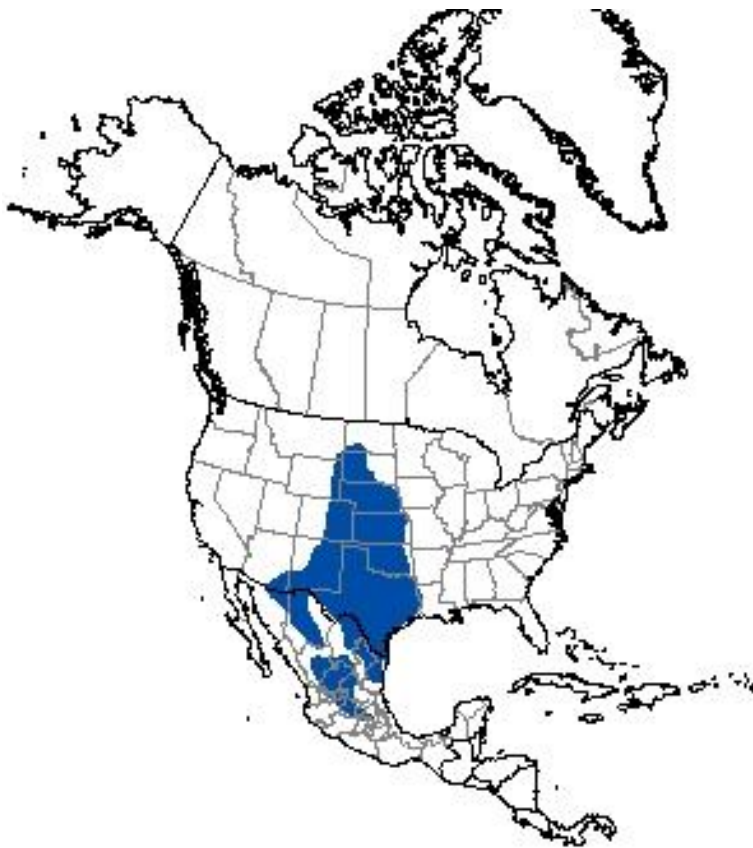
Figure 2: North American range of Chaetodipus hispidus . (Map from: Patterson, B. D., et al. (2007) Digital Distribution Maps of the Mammals of the Western Hemisphere, version 3.0, NatureServe, Arlington, Virginia.)