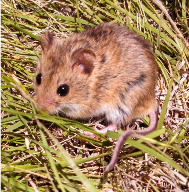
Figure 1: A harvest mouse ( Reithrodontomys spp.) captured in Goshen County, Wyoming.