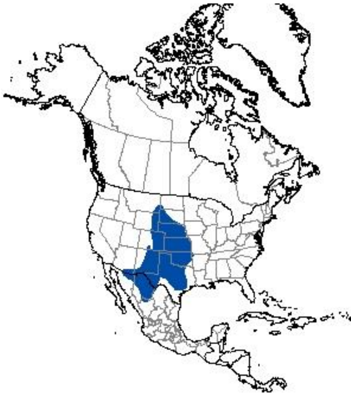
Figure 2: North American range of Reithrodontomys montanus . (Map from: Patterson, B. D., et al. (2007) Digital Distribution Maps of the Mammals of the Western Hemisphere, version 3.0, NatureServe, Arlington, Virginia.)