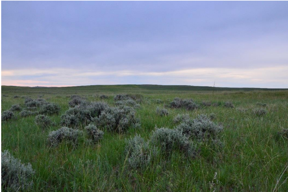
Figure 3: Plains Harvest Mouse habitat in Campbell County, Wyoming.