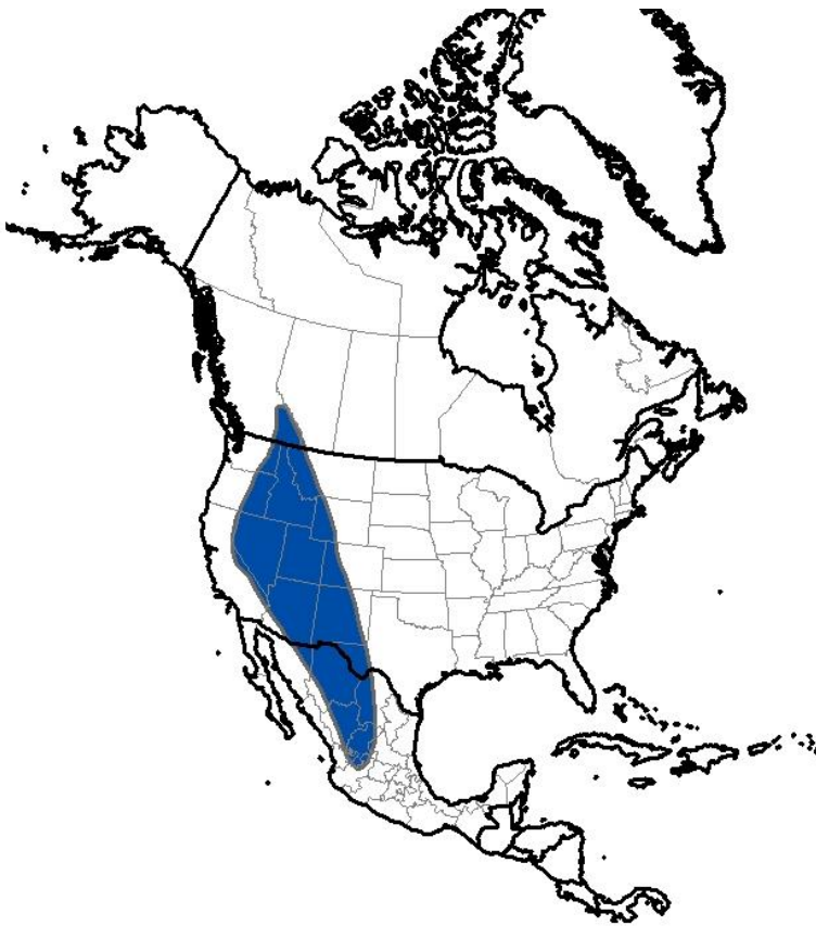
Figure 2: North American range of Euderma maculatum . (Map from: Patterson, B. D., et al. (2007) Digital Distribution Maps of the Mammals of the Western Hemisphere, version 3.0, NatureServe, Arlington, Virginia.)