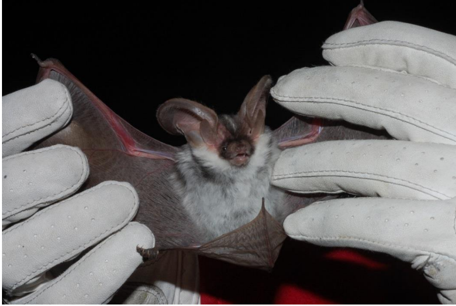
Figure 1: Ventral view of a Spotted Bat captured in Wyoming.