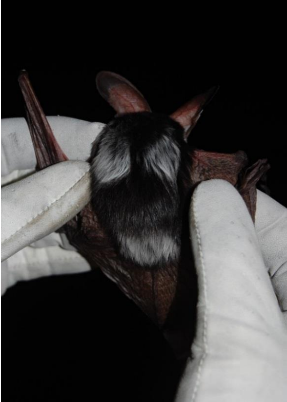
Figure 5: Dorsal view of a live-captured Spotted Bat showing the species' distinctive spots and coloring.